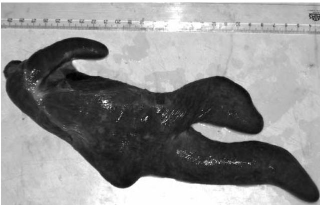
Fig 1. Macroscopic view of spleen

The cow was healthy, 3 years old, 752 kg body weight Holstein cow and no clinical symptoms observed related spleen abnormality. During the slaughter only one anomalous organ was spleen, the other organs were normal appearance and situs. Post mortem evaluation of the cow revealed that spleen was highly vascular and dark violet in color and weighted 412 g. Spleen length which between points was 26 cm and in the middle its thickness was width 5.1 cm. Splenic hilus was located in cranial part of organs and distribution of the vessels were normal one enter. It was very different form, both extremitas cranialis and caudalis had thin beginning, and had different two process and three lobes respectively in the spleen (Fig. 1). The one splenic process was located in extremitas cranialis. It length was 0.844 cm and width 1.734 cm. The other process was located on margo cranialis. It length was 2.261 cm and width 4.345 cm. The first lobe was located on the dorsal part of the margo caudalis. It arcuated caudally and length (margo caudalis to point of the process) was 8.5 cm and in the its middle width was 2 cm. The second lobe was located on distal part of margo caudalis and its had finger like curled shape. It direction was caudal, ventral and cranial respectively. Length of first curl was measured 5.1 cm, second curl was 4.2 cm and width of this process was measured 3.4 cm. The third lobe was look like continuing to organ and located to extremitas caudalis.